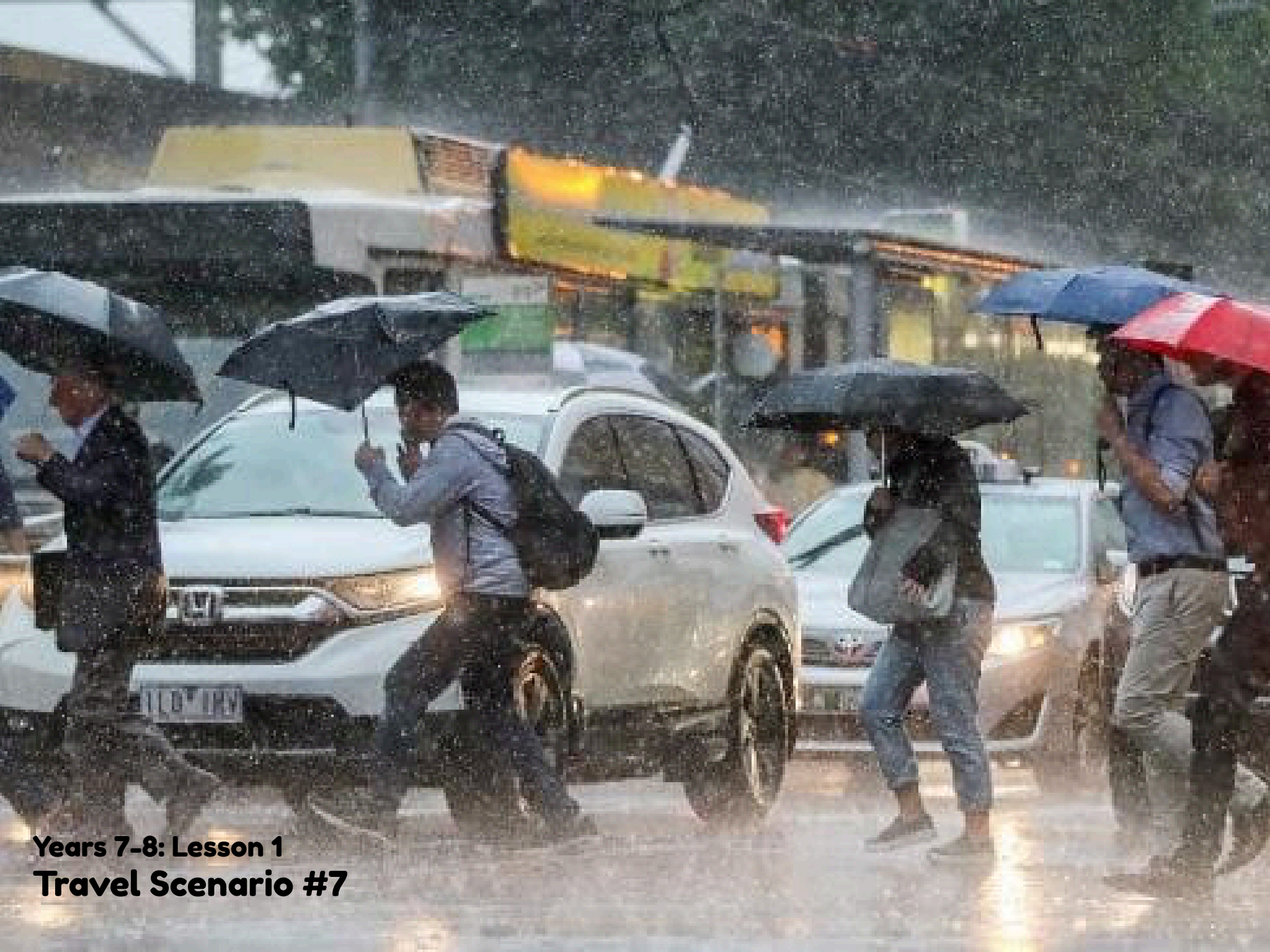
Years 7-8: Lesson 1 Travel Scenario #7